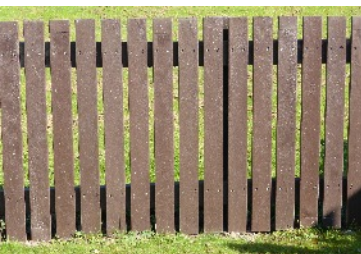
Alloa - Ochilview HA