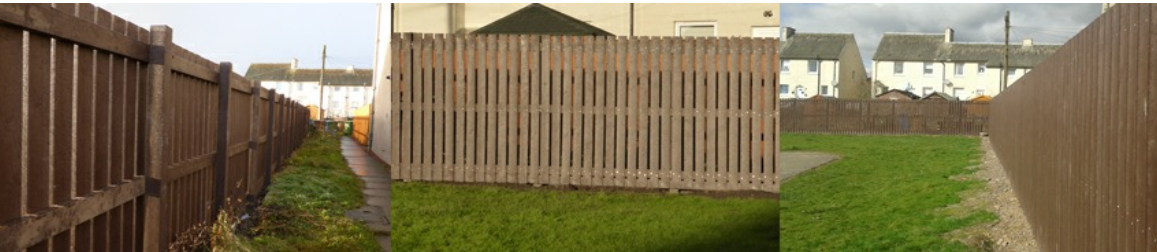
Sauchie - Clackmannanshire Council

Guidance on the design and installation is part of our service and we will be happy to work with you to help you and your contractor get the right specification for your fencing requirements.