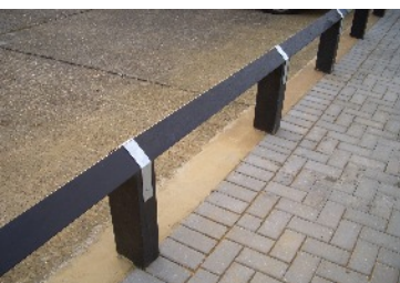
Knee rail fencing