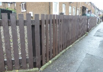
Dundee - Abertay HA