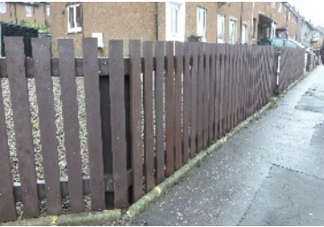
Dundee - Abertay HA