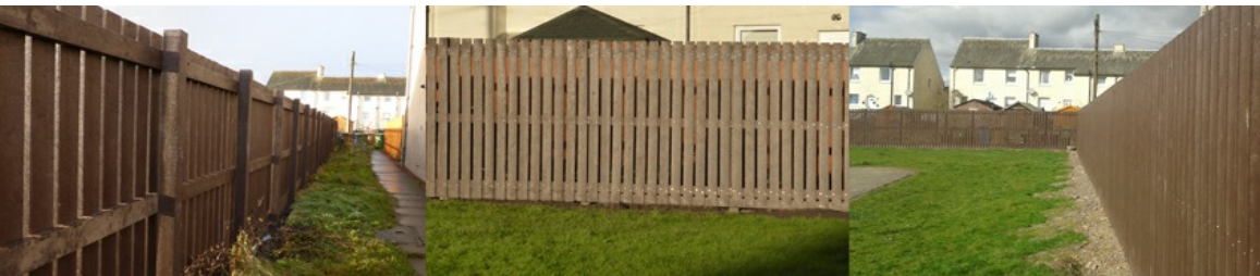
Sauchie - Clackmannanshire Council

Guidance on the design and installation is part of our service and we will be happy to work with you to help you and your contractor get the right specification for your fencing requirements.