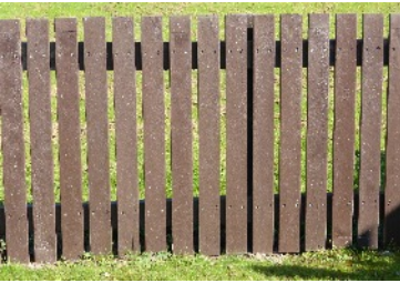
Alloa - Ochilview HA